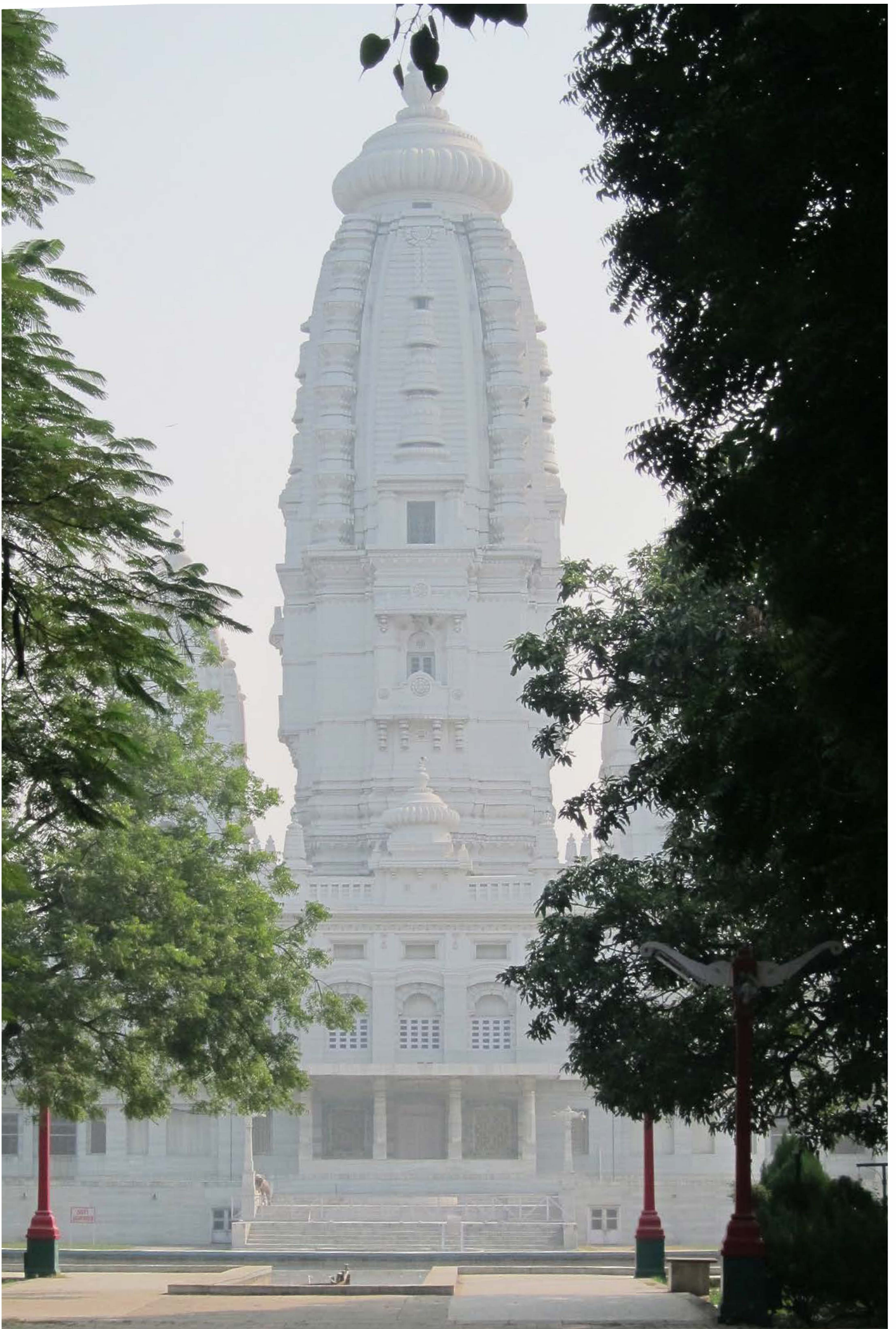
Jugilal Kumlupet Singhania temple